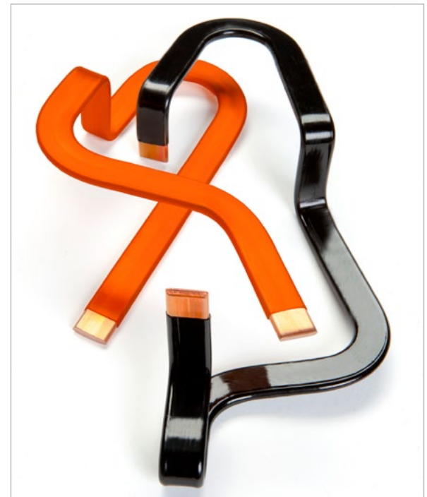
Luvata PA12 coated copper strip available in all RAL standard colours.

Luvata Pori Oy Kuparitie 5 FI-28330 Pori, Finland Tel: +358 2 626 6111